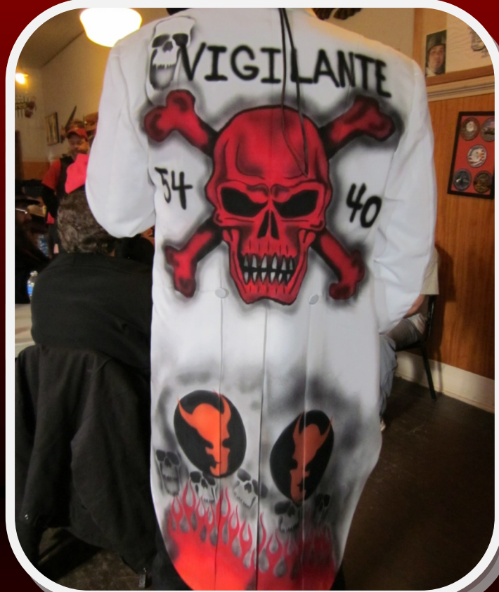
The Kid in the most kick ass Vigilante coat in all of Clamperdom!

We had a good turn out this year at the 2011 Doc Maynard Candlelight Doin's held Saturday April 17th at the Wilkeson Eagles Aeire in Wilkeson, WA. More than 40 brothers showed up and as always the cook crew served up some mean smoked tritip. Many thanks go out the the Wilkeson Eagles for putting up with us year after year.