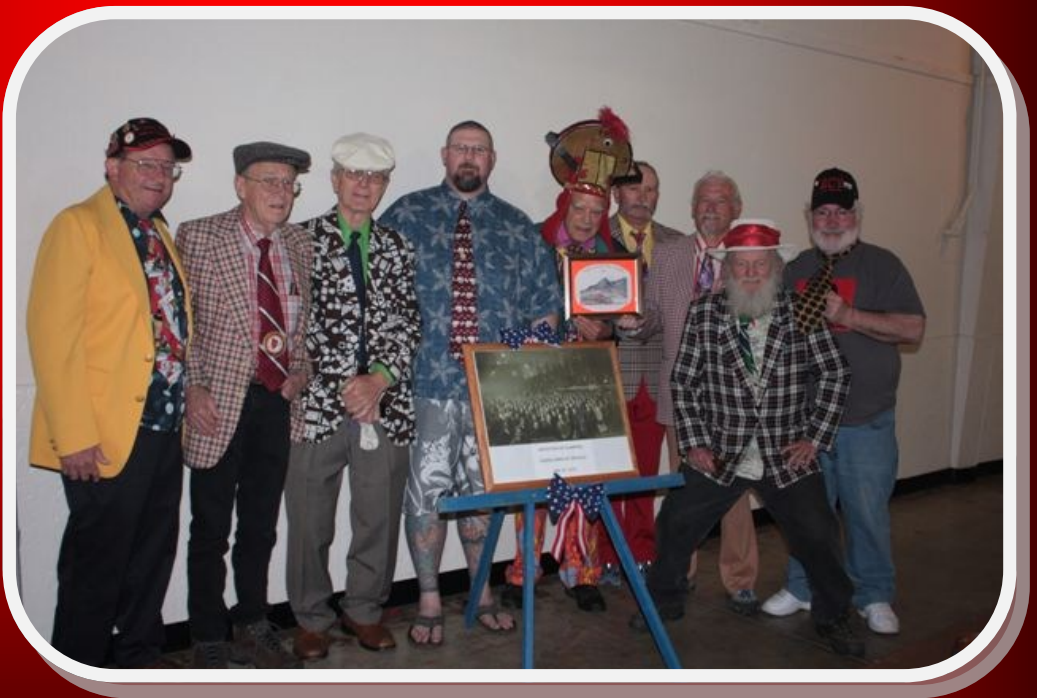
The Eastgate Businessmen's Breakfast Club member gathering at Grand Council 2011!

Members meet twice a year at TRASH and Grand Council.